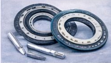
• Gaskets & Seals