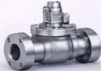
Safety Relief Valves