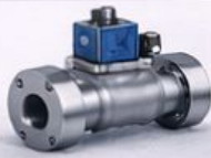
Knife Gate Valves