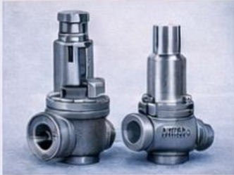
• Steam Traps