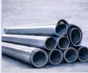
• Boiler Tubes