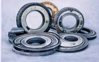
• Spiral wound gaskets