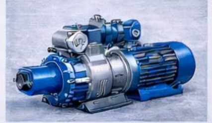
• Feed Water Pumps