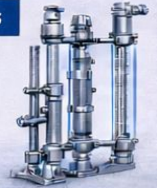
• Water Level Gauges