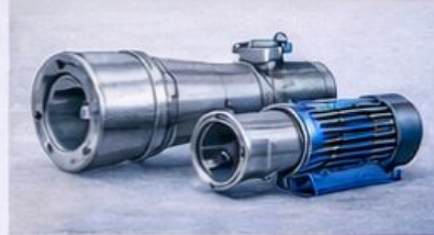
• Water Level Gauges