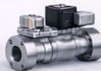
Pressure Reducing Valves