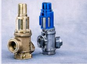
• Safety Valves